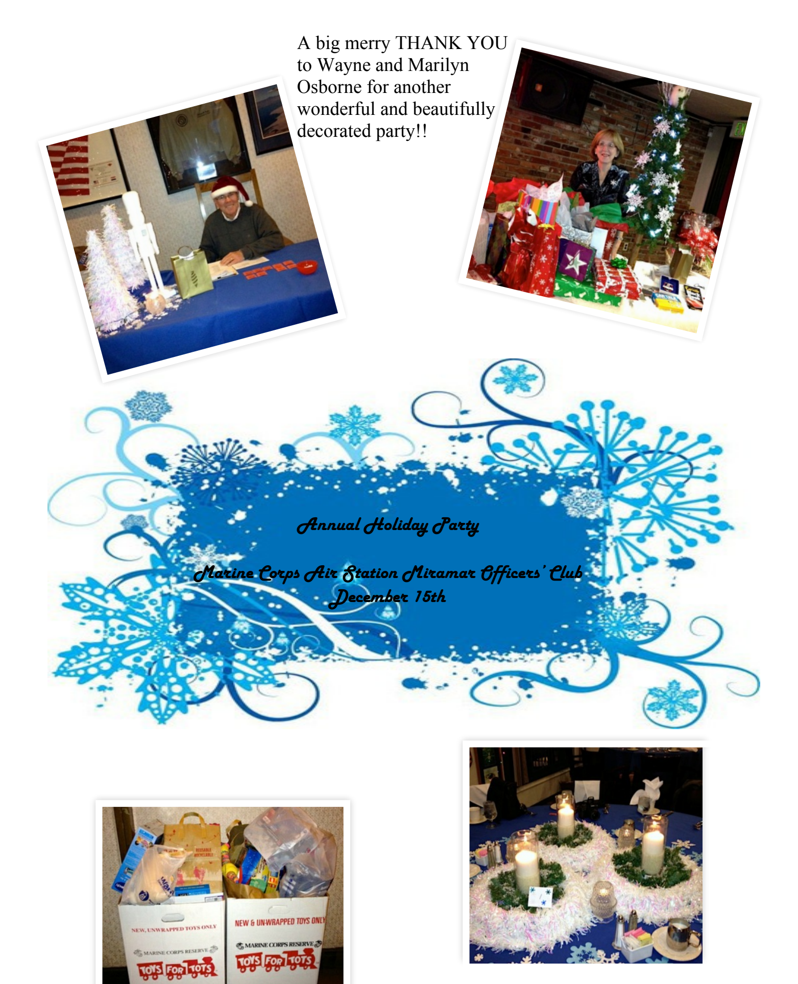
Good job NCoCC! Thanks for participating in The Toys for Tots program.